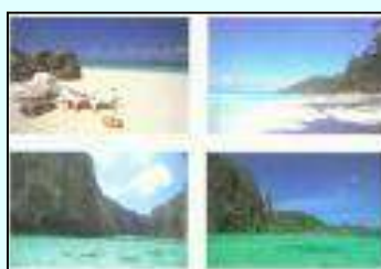
Phi Phi Islands