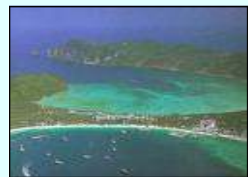
Phi Phi Islands