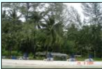
Ko Rang Yai