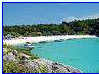
Koh Racha Yai