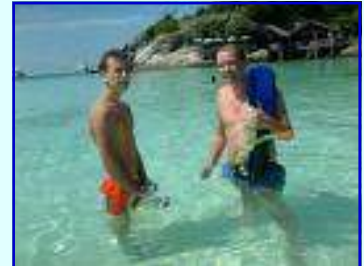
Koh Racha Yai